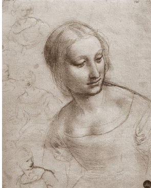
Leonardo da Vinci

This is not a programme in sequential historical form. Each session deals with some specific topic within Christian doctrine and tradition. Each is complete in itself, and is illustrated with over 70 art works that illustrate and amplify the subject of the day. These art works are digitally projected onto a large screen in glowing colour for the most part. They are not of the 'pretty-pretty' Madonna types of painting, but embrace a wide variety of styles. They range from the beautiful to the dramatic, the bizarre and in some cases even the comic. The greater part of them will almost certainly be unknown to most people.