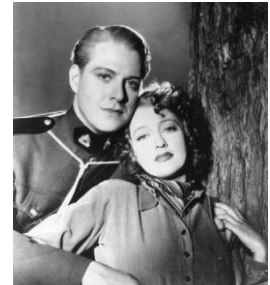
Nelson Eddy and Jeanette Macdonald in Rose Marie