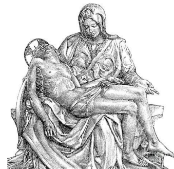
Pieta by Michelangelo

The material presented is based on many years of study, and backed up by the hundreds of books in my own personal library. Though academic in essence, the presentations are fascinating and entertaining. Examples of the topics are ADAM AND EVE AND THE GARDEN, ART AND THE AFTERLIFE, THE BEGINNINGS OF CHRISTIAN ART, THE HOLY TRINITY, DEVILS AND DEMONS IN CHRISTIAN TRADITION. No significant knowledge about Christianity is needed to enjoy this course, but naturally some general familiarity with its teachings is an advantage.